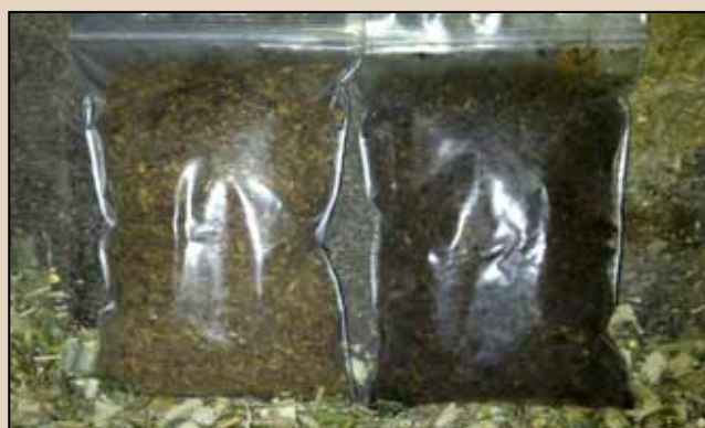
Without Penergetic k With Penergetic k